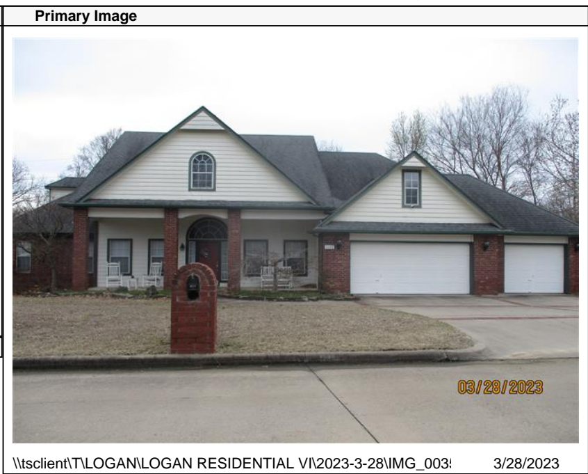
\\tsclient\T\LOGAN\LOGAN RESIDENTIAL VI\2023-3-28\IMG_003! 3/28/2023