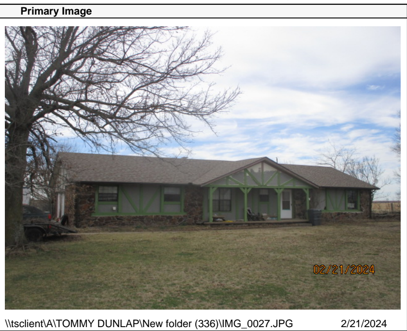
\\tsclient\A\TOMMY DUNLAP\New folder (336)\IMG_0027.JPG 2/21/2024