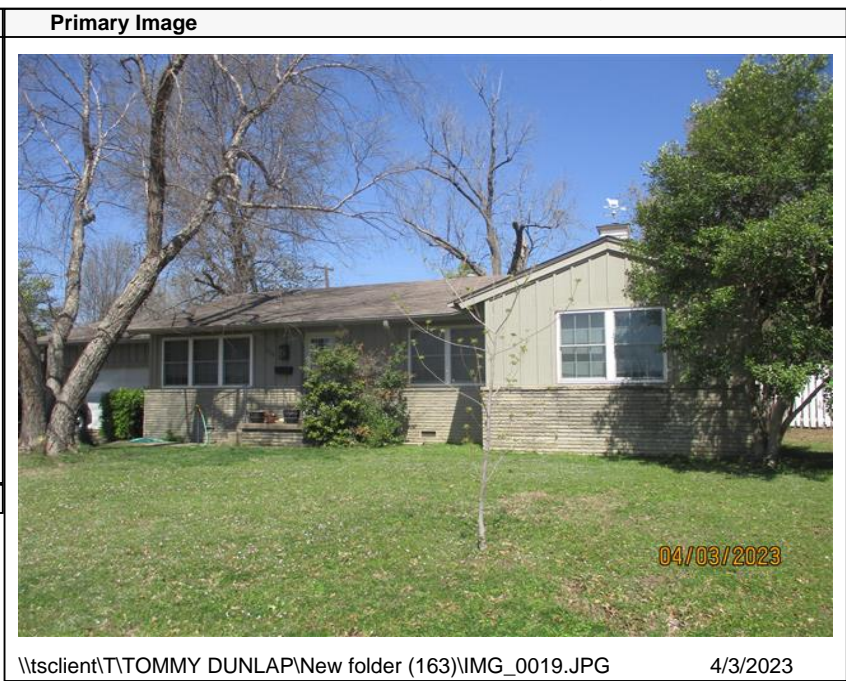
\\tsclient\T\TOMMY DUNLAP\New folder (163)\IMG_0019.JPG 4/3/2023