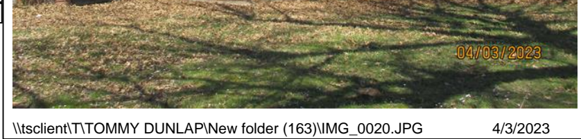
\\tsclient\T\TOMMY DUNLAP\New folder (163)\IMG_0020.JPG 4/3/2023