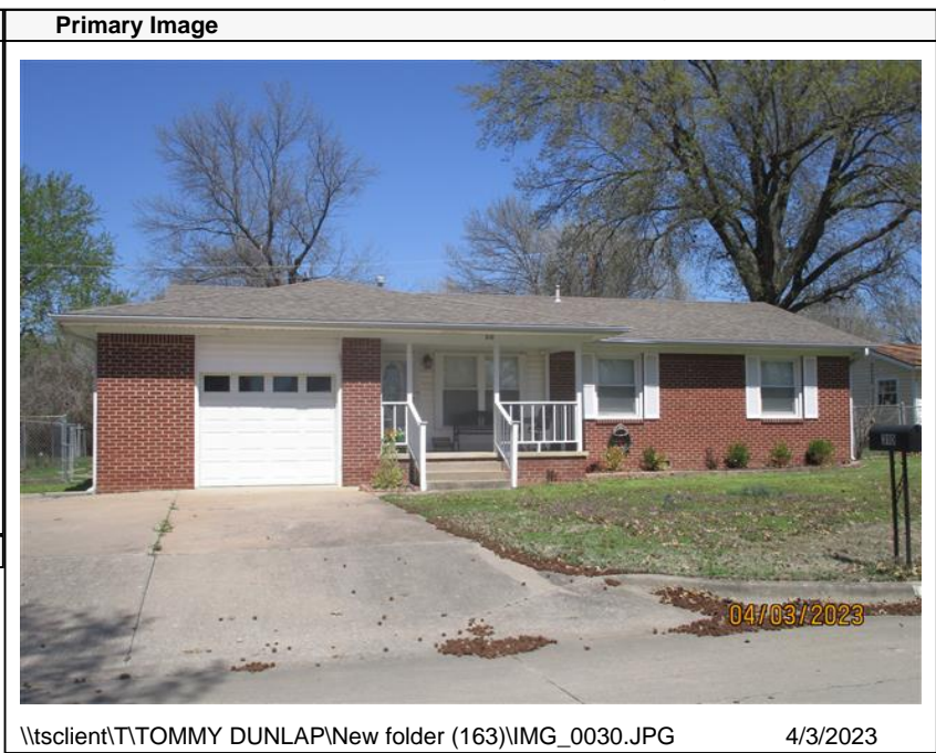
\\tsclient\T\TOMMY DUNLAP\New folder (163)\IMG_0030.JPG 4/3/2023