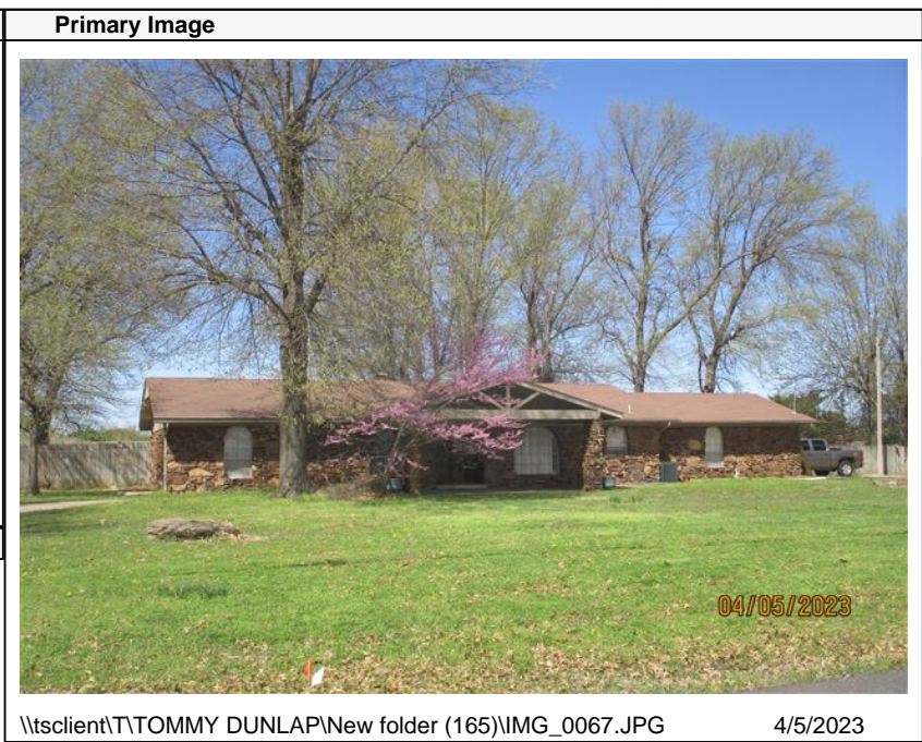
\\tsclient\T\TOMMY DUNLAP\New folder (165)\IMG_0067.JPG 4/5/2023