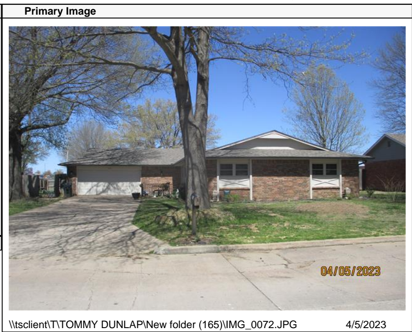
\\tsclient\T\TOMMY DUNLAP\New folder (165)\IMG_0072.JPG 4/5/2023