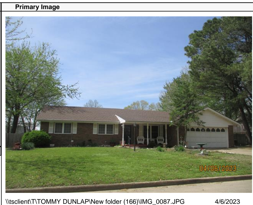
\\tsclient\T\TOMMY DUNLAP\New folder (166)\IMG_0087.JPG 4/6/2023