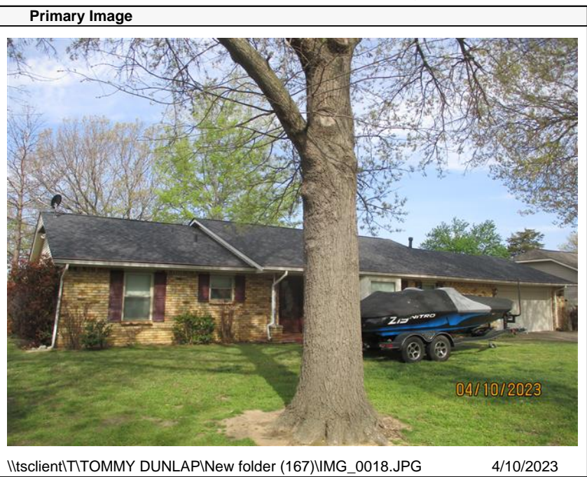
\\tsclient\T\TOMMY DUNLAP\New folder (167)\IMG_0018.JPG 4/10/2023