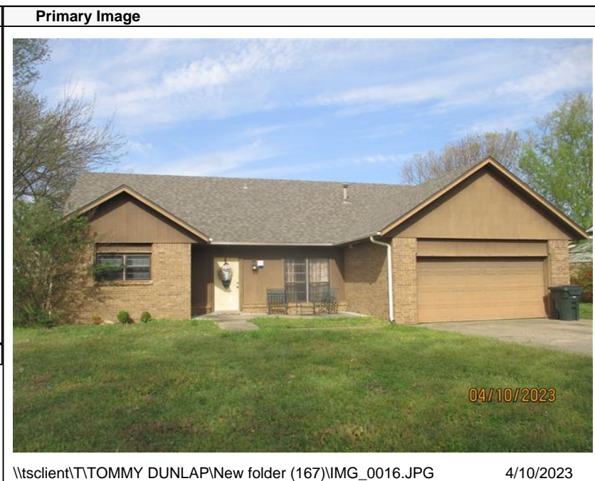
\\tsclient\T\TOMMY DUNLAP\New folder (167)\IMG_0016.JPG 4/10/2023