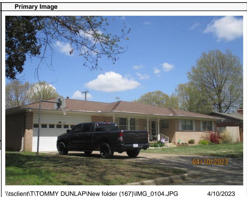
\\tsclient\T\TOMMY DUNLAP\New folder (167)\IMG_0104.JPG 4/10/2023