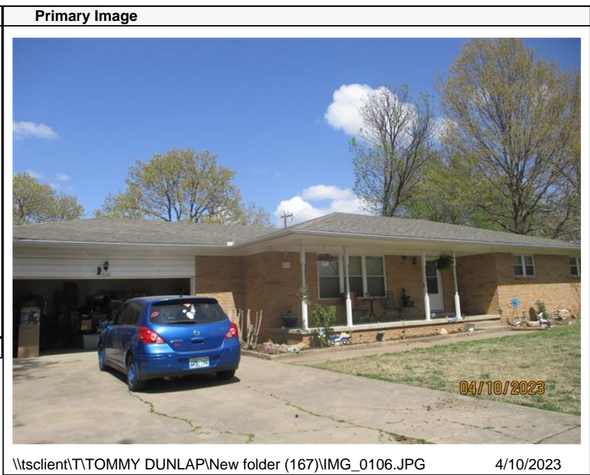
\\tsclient\T\TOMMY DUNLAP\New folder (167)\IMG_0106.JPG 4/10/2023