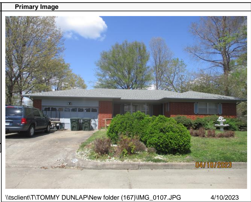
\\tsclient\T\TOMMY DUNLAP\New folder (167)\IMG_0107.JPG 4/10/2023