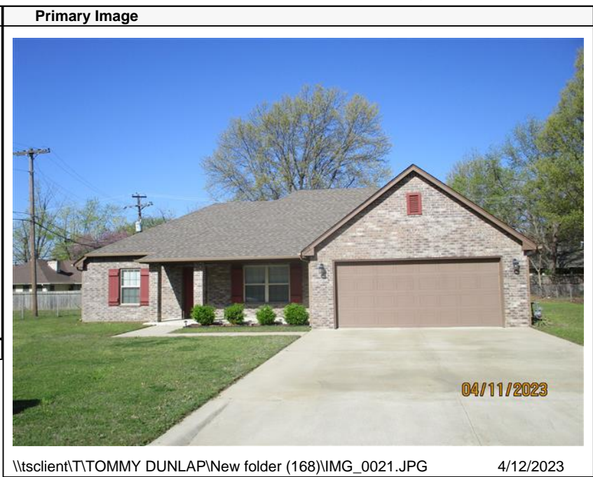
\\tsclient\T\TOMMY DUNLAP\New folder (168)\IMG_0021.JPG 4/12/2023