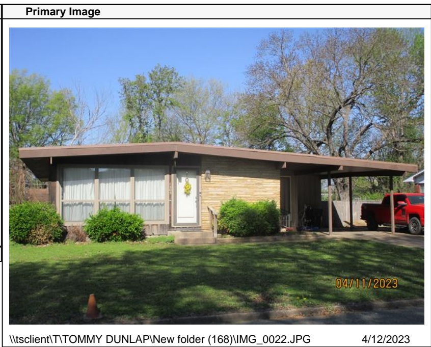
\\tsclient\T\TOMMY DUNLAP\New folder (168)\IMG_0022.JPG 4/12/2023