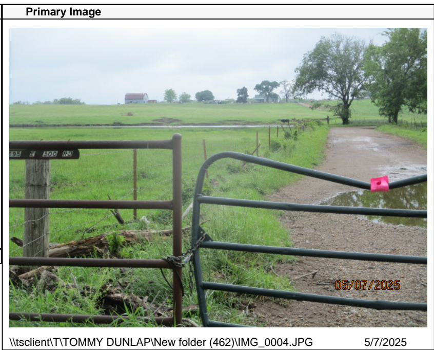
\\tsclient\T\TOMMY DUNLAP\New folder (462)\IMG_0004.JPG 5/7/2025