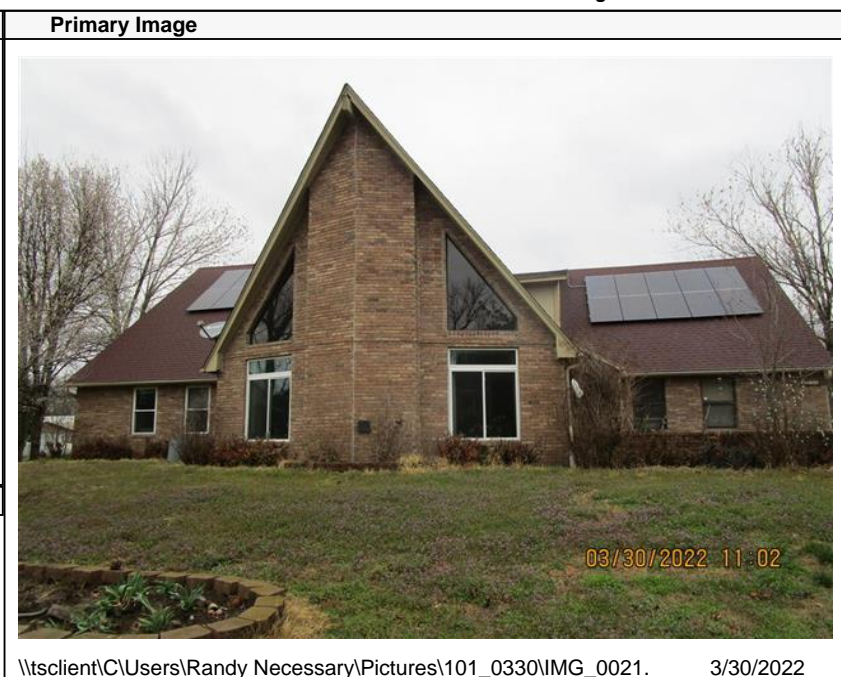
\\tsclient\C\Users\Randy Necessary\Pictures\101_0330\IMG_0021. 3/30/2022