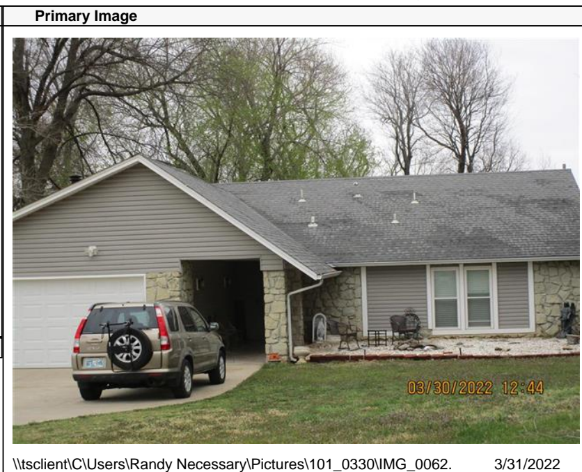
\\tsclient\C\Users\Randy Necessary\Pictures\101_0330\IMG_0062. 3/31/2022