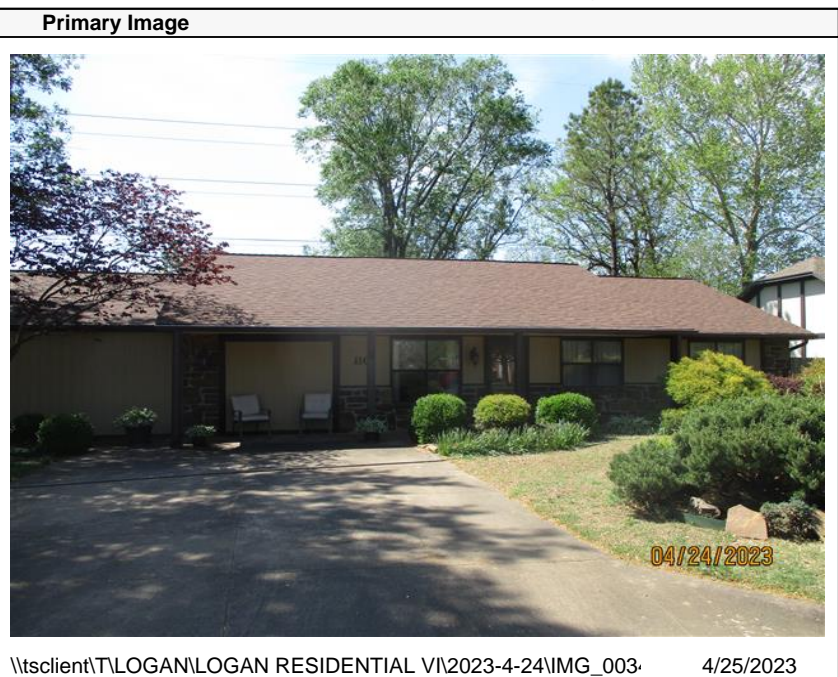
\\tsclient\T\LOGAN\LOGAN RESIDENTIAL VI\2023-4-24\IMG_003 4/25/2023