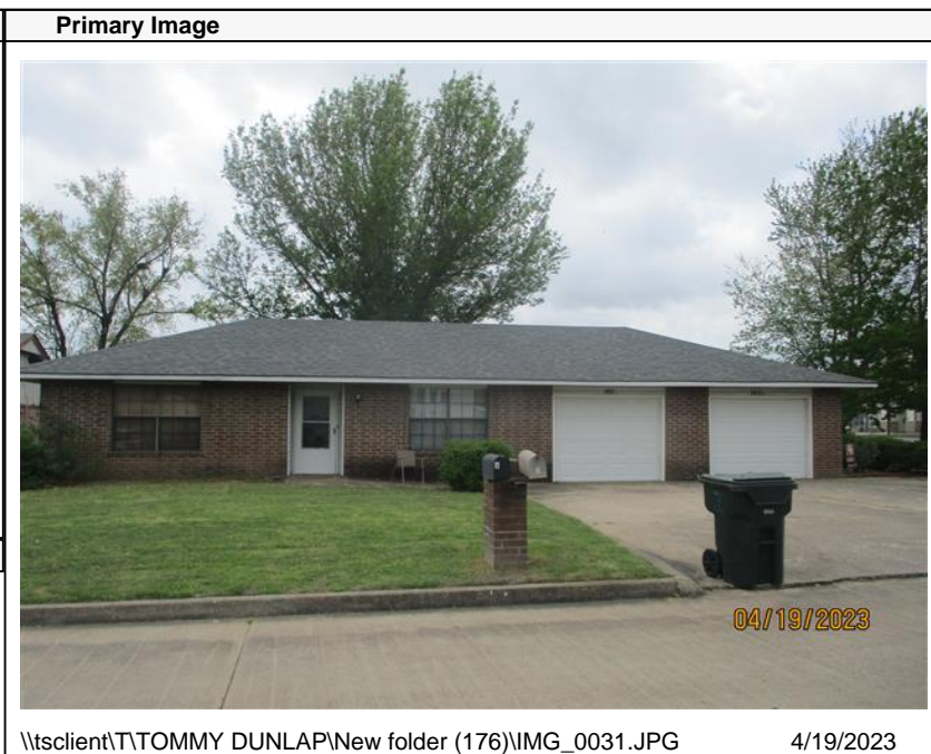
\\tsclient\T\TOMMY DUNLAP\New folder (176)\IMG_0031.JPG 4/19/2023