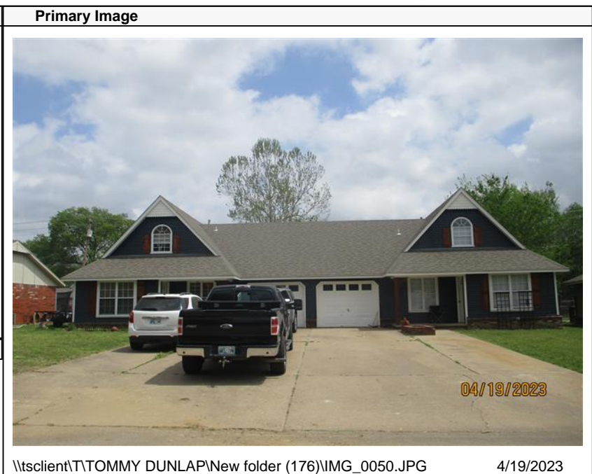
\\tsclient\T\TOMMY DUNLAP\New folder (176)\IMG_0050.JPG 4/19/2023