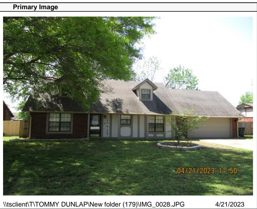
\\tsclient\T\TOMMY DUNLAP\New folder (179)\IMG_0028.JPG 4/21/2023