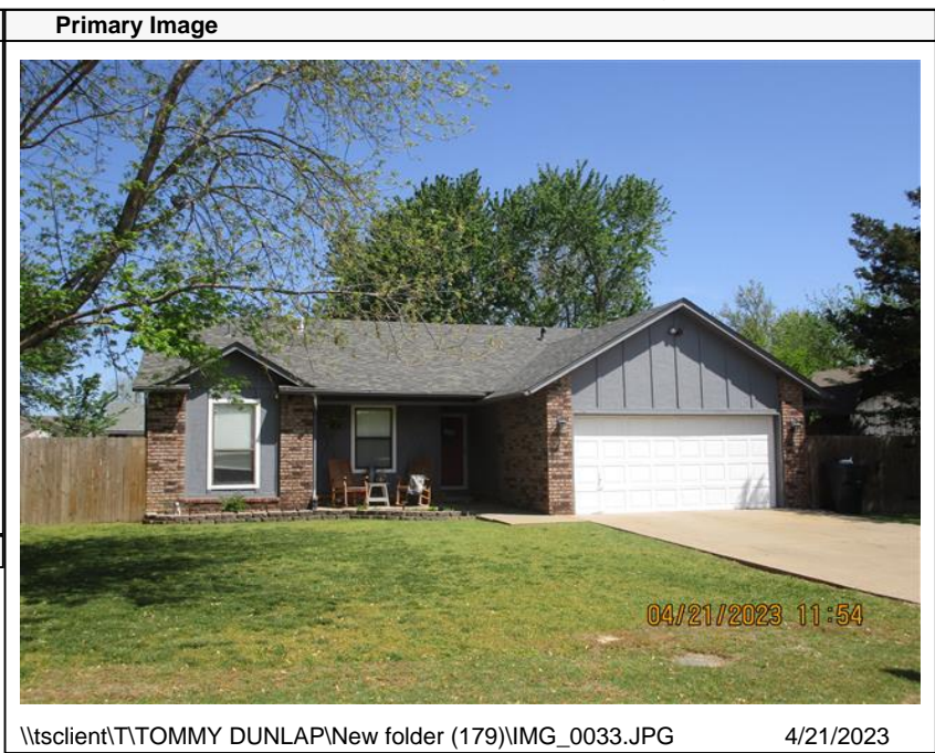
\\tsclient\T\TOMMY DUNLAP\New folder (179)\IMG_0033.JPG 4/21/2023