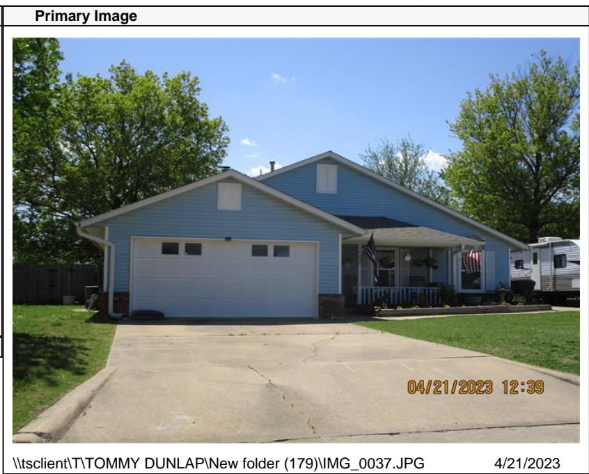
\\tsclient\T\TOMMY DUNLAP\New folder (179)\IMG_0037.JPG 4/21/2023