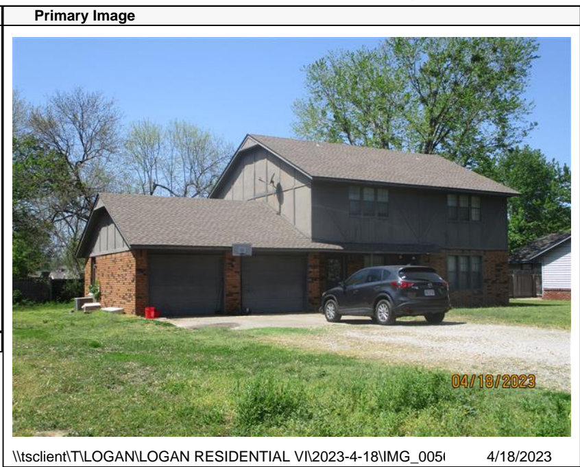
\\tsclient\T\LOGAN\LOGAN RESIDENTIAL VI\2023-4-18\IMG_005I 4/18/2023