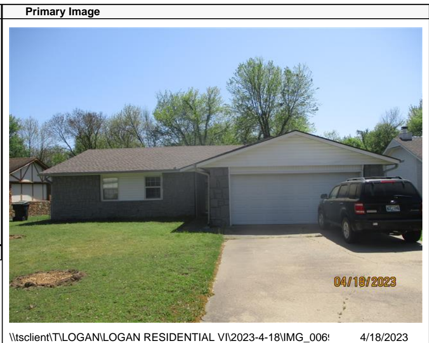
\\tsclient\T\LOGAN\LOGAN RESIDENTIAL VI\2023-4-18\IMG_006! 4/18/2023