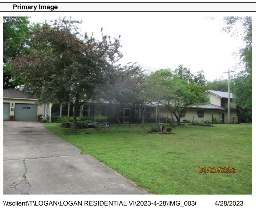
\\tsclient\T\LOGAN\LOGAN RESIDENTIAL VI\2023-4-28\IMG_003I 4/28/2023