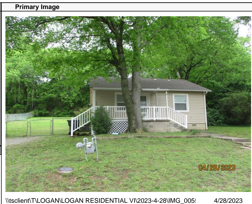
\\tsclient\T\LOGAN\LOGAN RESIDENTIAL VI\2023-4-28\IMG_005! 4/28/2023