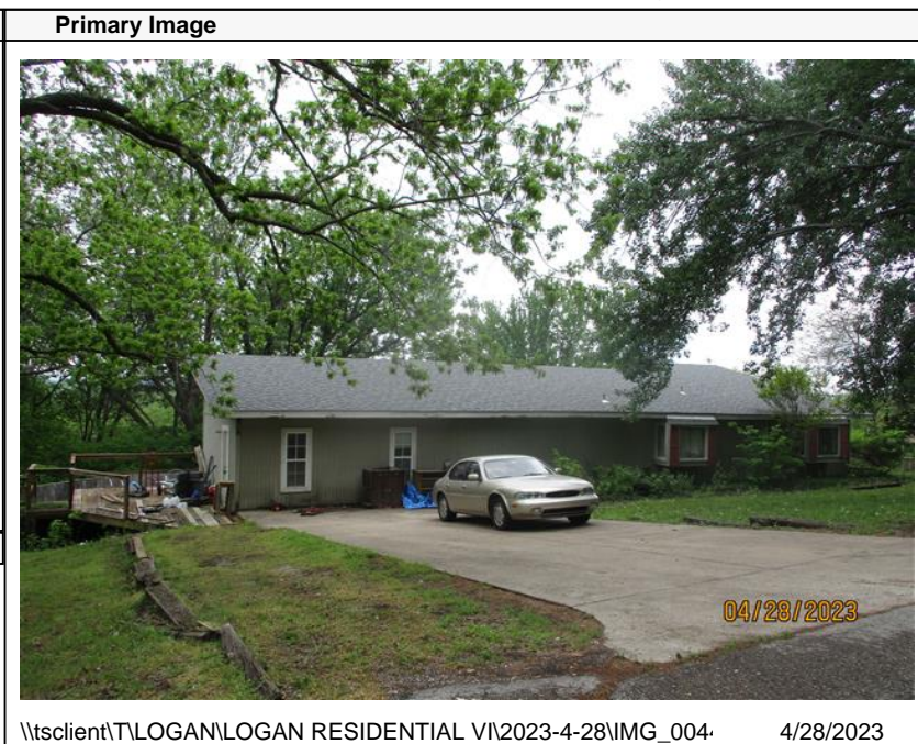
\\tsclient\T\LOGAN\LOGAN RESIDENTIAL VI\2023-4-28\IMG_004 4/28/2023