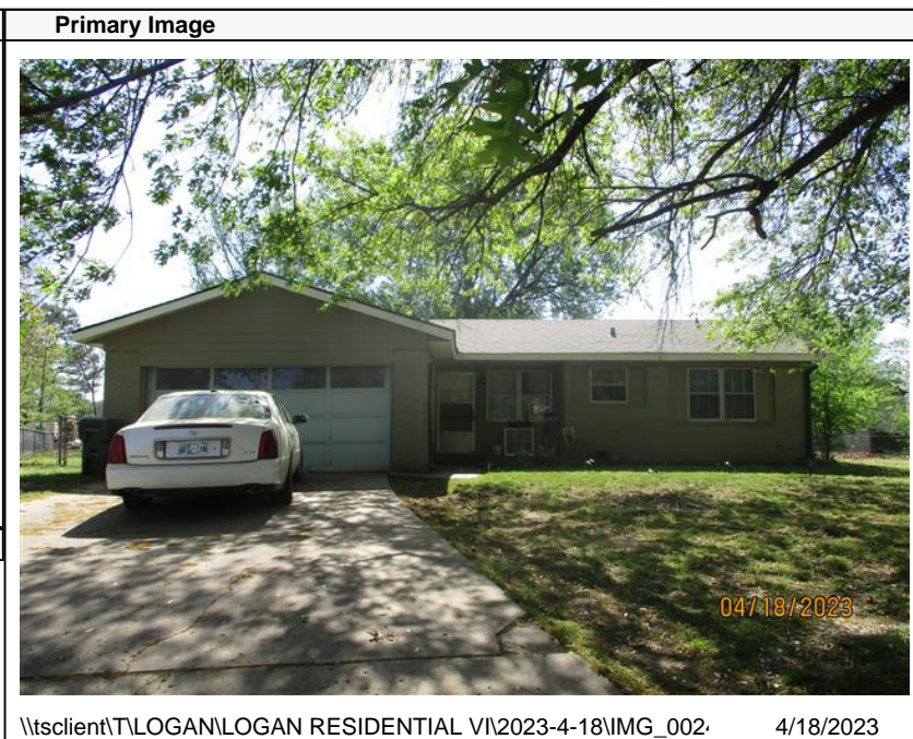
\\tsclient\T\LOGAN\LOGAN RESIDENTIAL VI\2023-4-18\IMG_002 4/18/2023