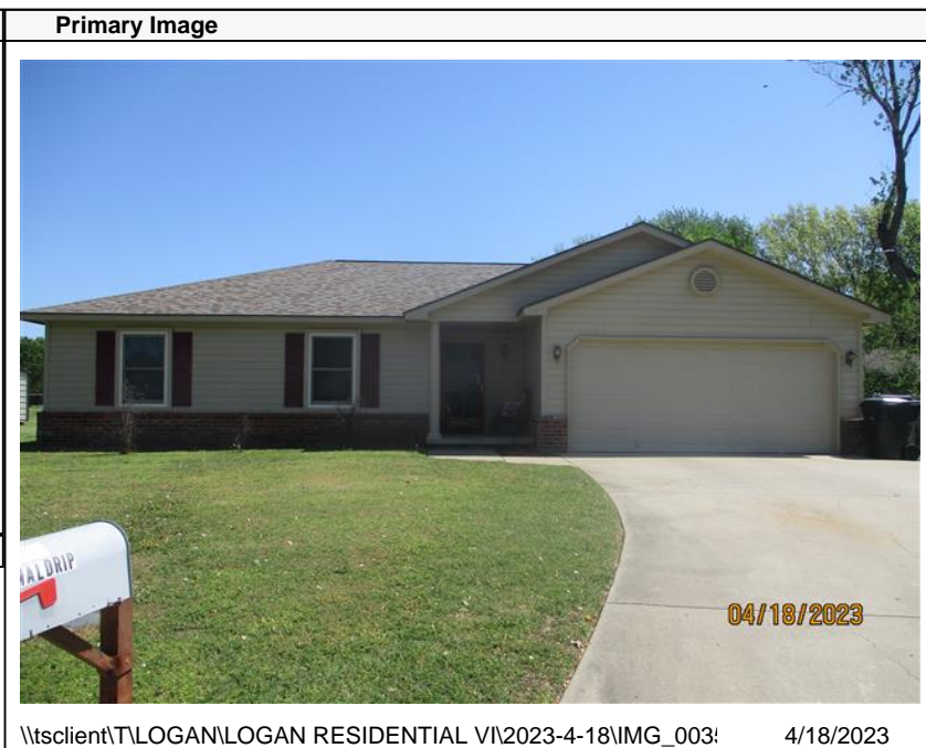
\\tsclient\T\LOGAN\LOGAN RESIDENTIAL VI\2023-4-18\IMG_003! 4/18/2023