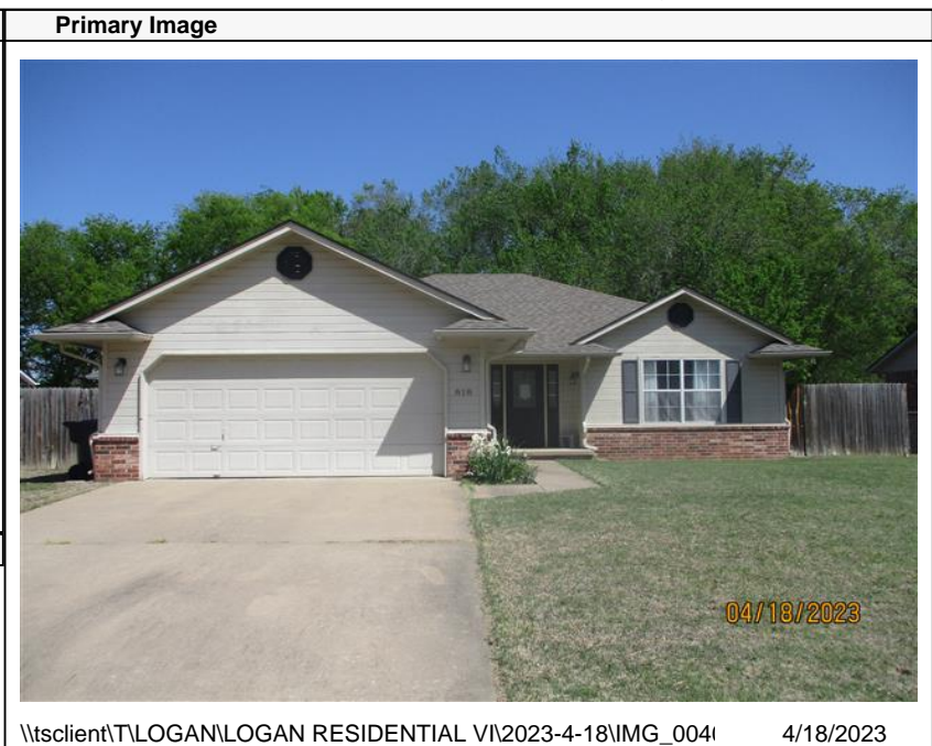
\\tsclient\T\LOGAN\LOGAN RESIDENTIAL VI\2023-4-18\IMG_004I 4/18/2023