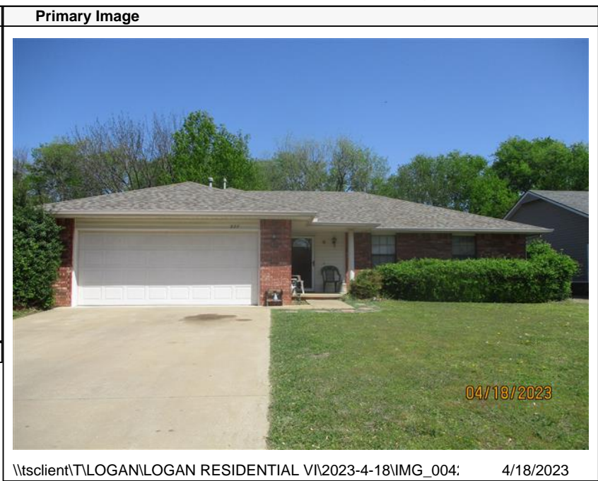
\\tsclient\T\LOGAN\LOGAN RESIDENTIAL VI\2023-4-18\IMG_004; 4/18/2023