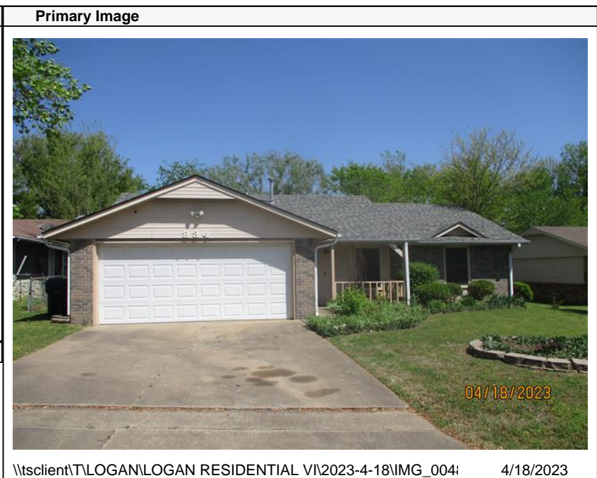
\\tsclient\T\LOGAN\LOGAN RESIDENTIAL VI\2023-4-18\IMG_004 4/18/2023