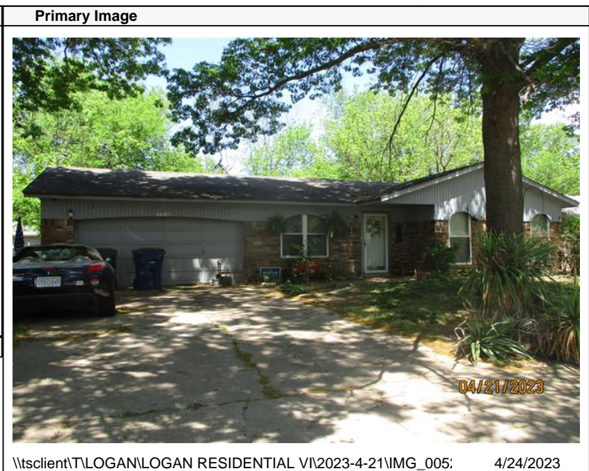
\\tsclient\T\LOGAN\LOGAN RESIDENTIAL VI\2023-4-21\IMG_005; 4/24/2023