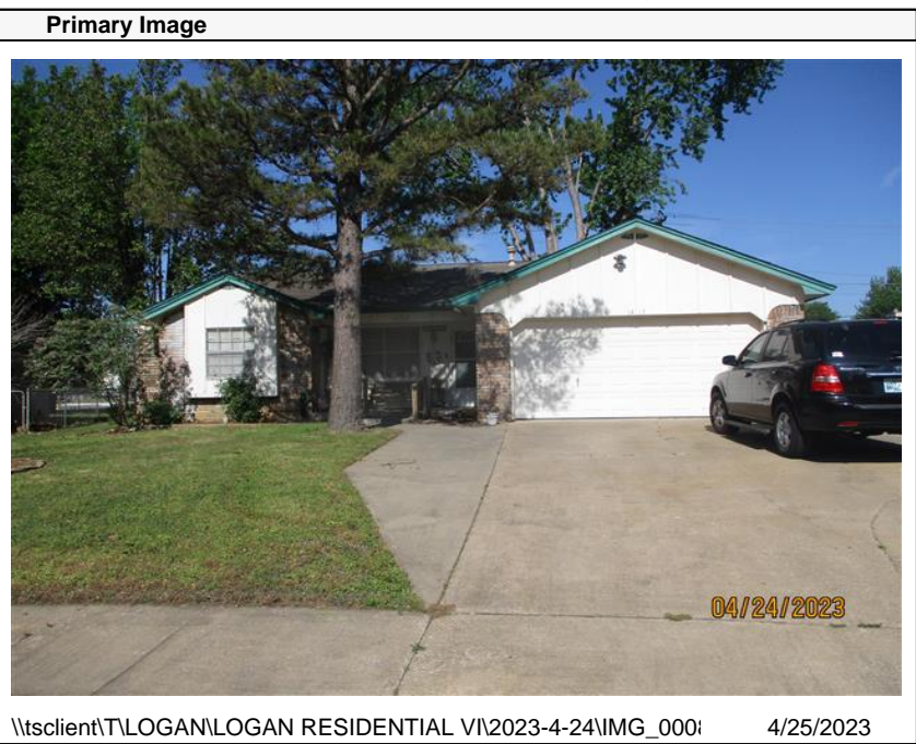
\\tsclient\T\LOGAN\LOGAN RESIDENTIAL VI\2023-4-24\IMG_0001 4/25/2023