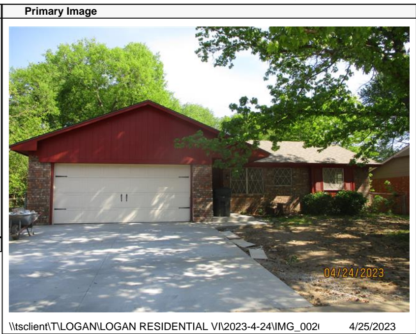
\\tsclient\T\LOGAN\LOGAN RESIDENTIAL VI\2023-4-24\IMG_002I 4/25/2023