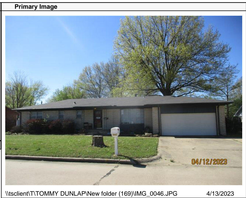
\\tsclient\T\TOMMY DUNLAP\New folder (169)\IMG_0046.JPG 4/13/2023