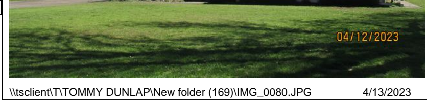
\\tsclient\T\TOMMY DUNLAP\New folder (169)\IMG_0080.JPG 4/13/2023