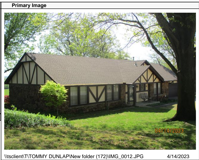
\\tsclient\T\TOMMY DUNLAP\New folder (172)\IMG_0012.JPG 4/14/2023