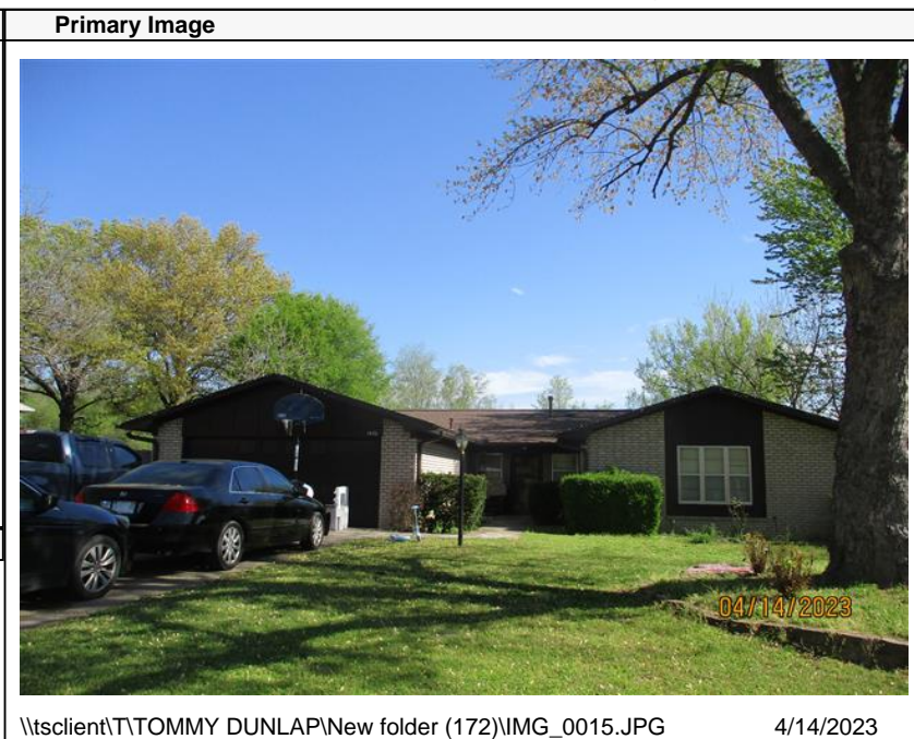
\\tsclient\T\TOMMY DUNLAP\New folder (172)\IMG_0015.JPG 4/14/2023