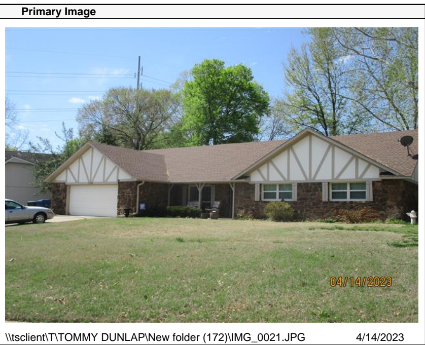
\\tsclient\T\TOMMY DUNLAP\New folder (172)\IMG_0021.JPG 4/14/2023