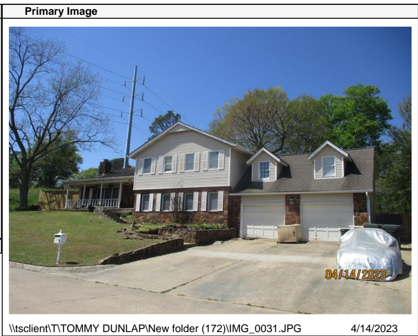
\\tsclient\T\TOMMY DUNLAP\New folder (172)\IMG_0031.JPG 4/14/2023