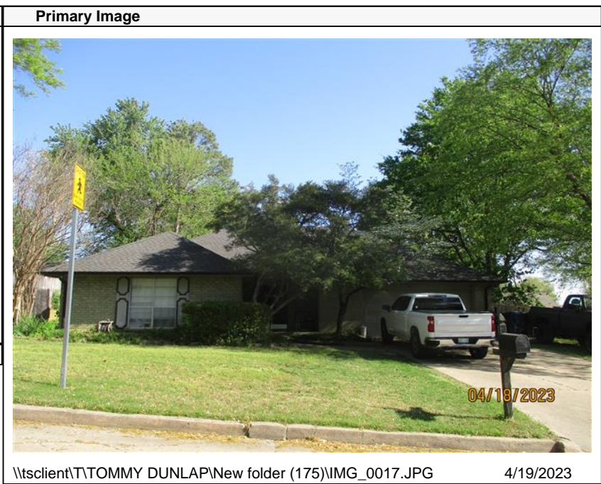
\\tsclient\T\TOMMY DUNLAP\New folder (175)\IMG_0017.JPG 4/19/2023