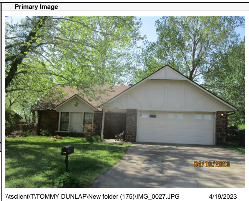
\\tsclient\T\TOMMY DUNLAP\New folder (175)\IMG_0027.JPG 4/19/2023