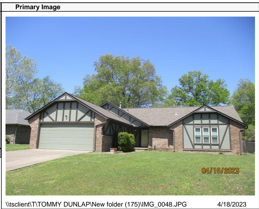
\\tsclient\T\TOMMY DUNLAP\New folder (175)\IMG_0048.JPG 4/18/2023