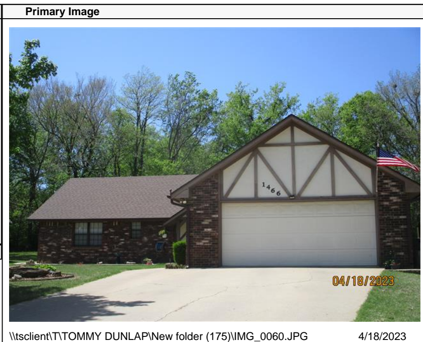
\\tsclient\T\TOMMY DUNLAP\New folder (175)\IMG_0060.JPG 4/18/2023