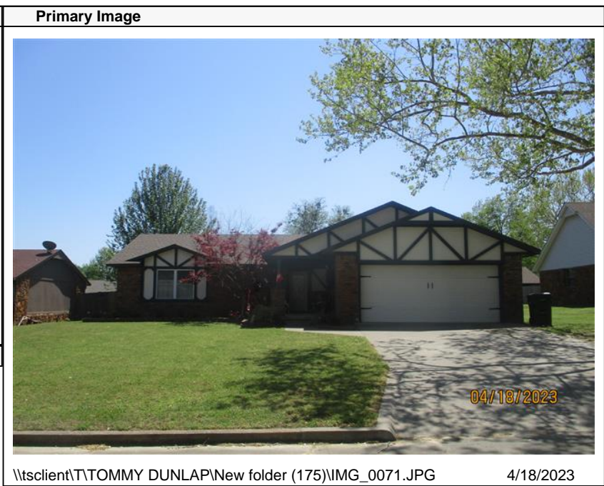
\\tsclient\T\TOMMY DUNLAP\New folder (175)\IMG_0071.JPG 4/18/2023