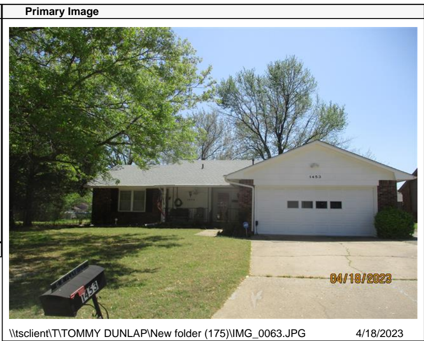
\\tsclient\T\TOMMY DUNLAP\New folder (175)\IMG_0063.JPG 4/18/2023