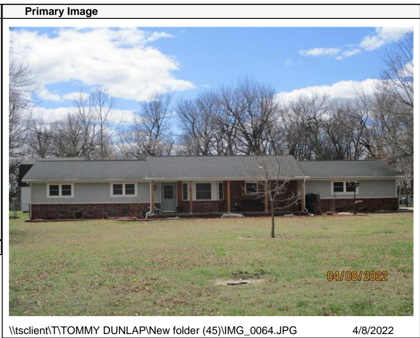
\\tsclient\T\TOMMY DUNLAP\New folder (45)\IMG_0064.JPG 4/8/2022